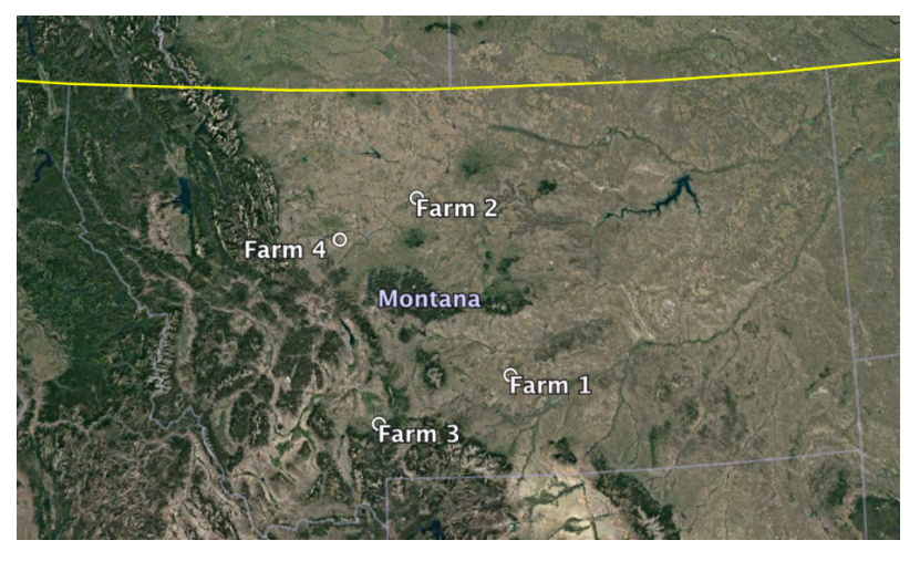
Fig. 1 Locations of farms in Montana